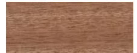
Unpainted dark veneer