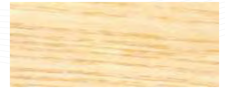
Unpainted light veneer